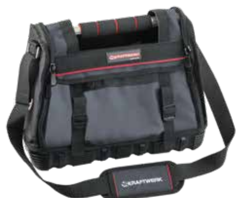
390 x 210 x 300 mm | max. \Delta 18 kg