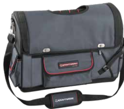
440 x 260 x 370 mm | max. \Delta 23 kg