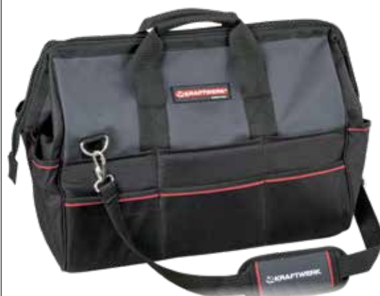
510 x 360 x 400 mm | max. \Delta 20 kg