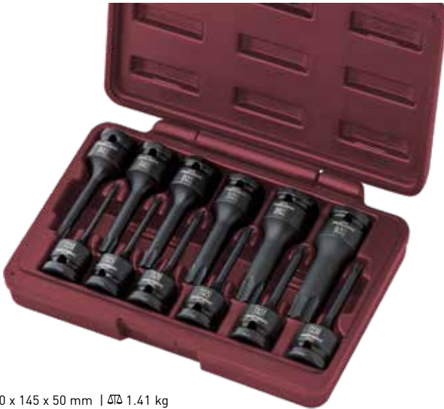
210 x 145 x 50 mm | Δ 1.41 kg