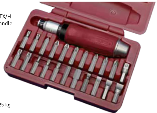
221 x 114 x 45 mm | Δ 1.25 kg