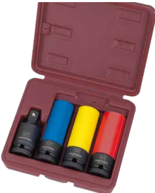
145 x 130 x 43 mm | Δ 0.89 kg