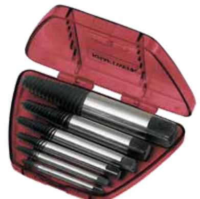
144 x 143 x 25 mm | Δ 0.22 kg