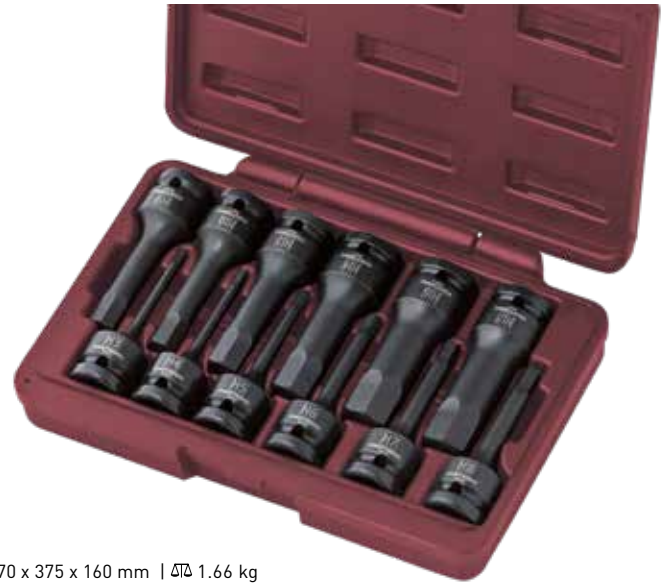
470 x 375 x 160 mm | Δ 1.66 kg