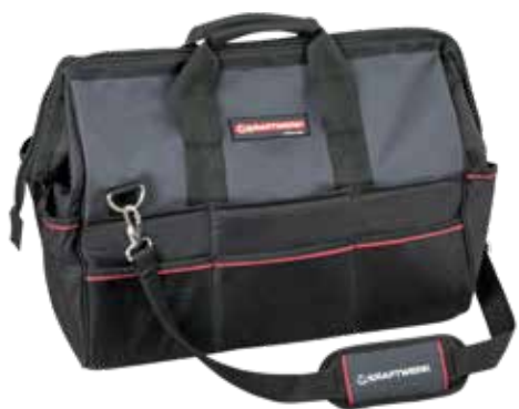
400 x 220 x 350 mm | max. \Delta 15 kg